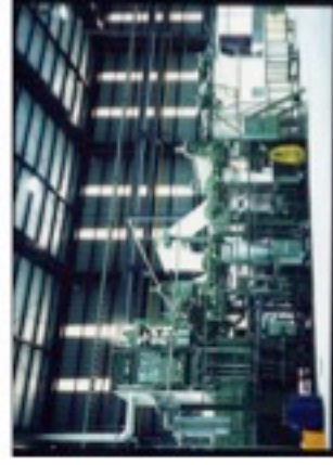
Corrugate Flow Washing Range