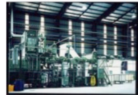
Corrugate Flow Washing Range