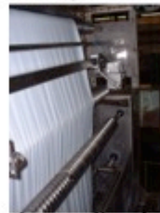
Cloth spreading dev.

This range is suitable for polyester woven fabrics! It is possible to free tension that hanging bar carries in the main bath. Our technology can 2lays production for high production performance.